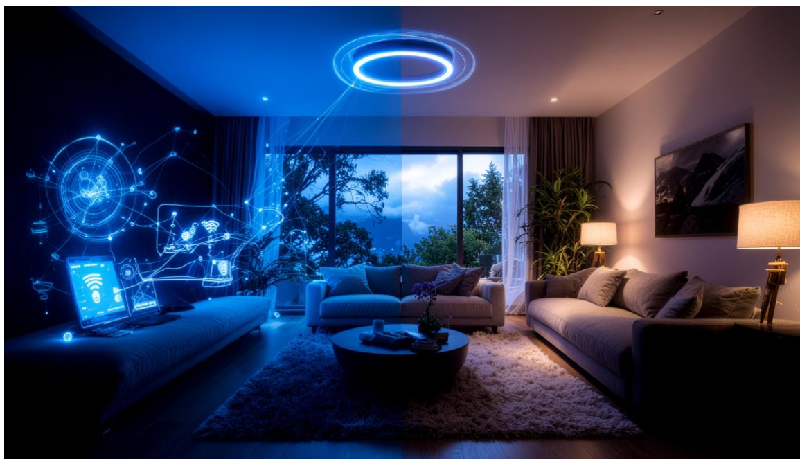
Figure 2.1 — From rules to orchestration. Left: conventional “smart home” relying on deterministic, user-configured flows. Right: the Agentic Home, where probabilistic interpretation and agentic orchestration drive adaptive behavior.

Some vendors layer on superficial natural language interfaces—so-called NLP wrappers. These enable voice control, but not true contextual understanding. Commands are transcribed and matched to fixed actions, with no appreciation of intent, history, or cause. These interfaces simulate intelligence without delivering it.